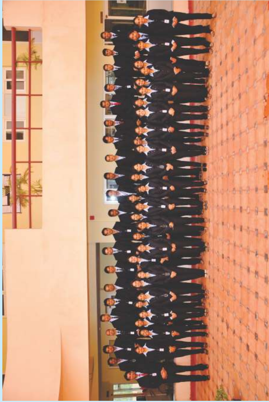
Group Photo of PGDHM 2011-13 Batch For Summer Internships May-June 2012